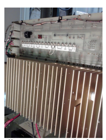
Illustration 5: Back of Repeater