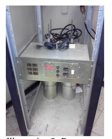
Illustration 3: Power Supply