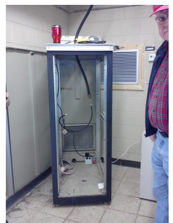
Illustration 1: Gutted Empty Equipment Enclosure