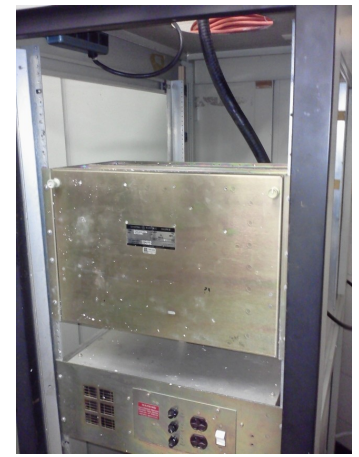
Illustration 4: New Repeater above Power Supply