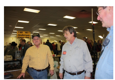
February 2012 Social