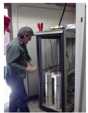
Illustration 2: Duplexers