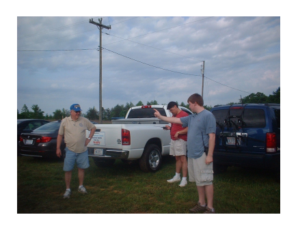
RCARC Swap Fest 2012 Photos