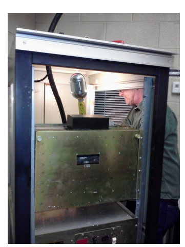
Illustration 6: Controller above Repeater