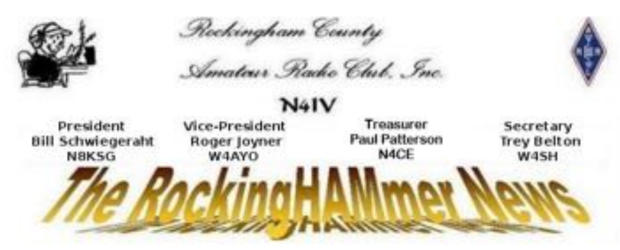
Post Office Box 2264, Reidsville, North Carolina, 27323

April 2019 Vol. 17 No. 4 <u>www.n4iv.org</u>