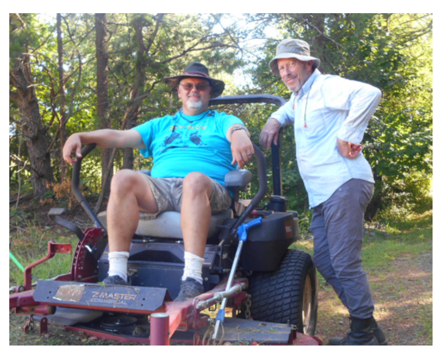
"Grass chewers enjoy another July mowing adventure at the repeater site. Sorry you missed it. Look at how happy they are!"